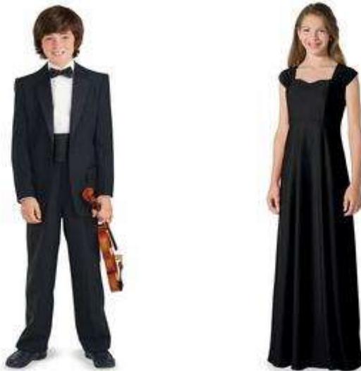
YOUTH CONCERTO DRESS (BLACK) ($67.00)